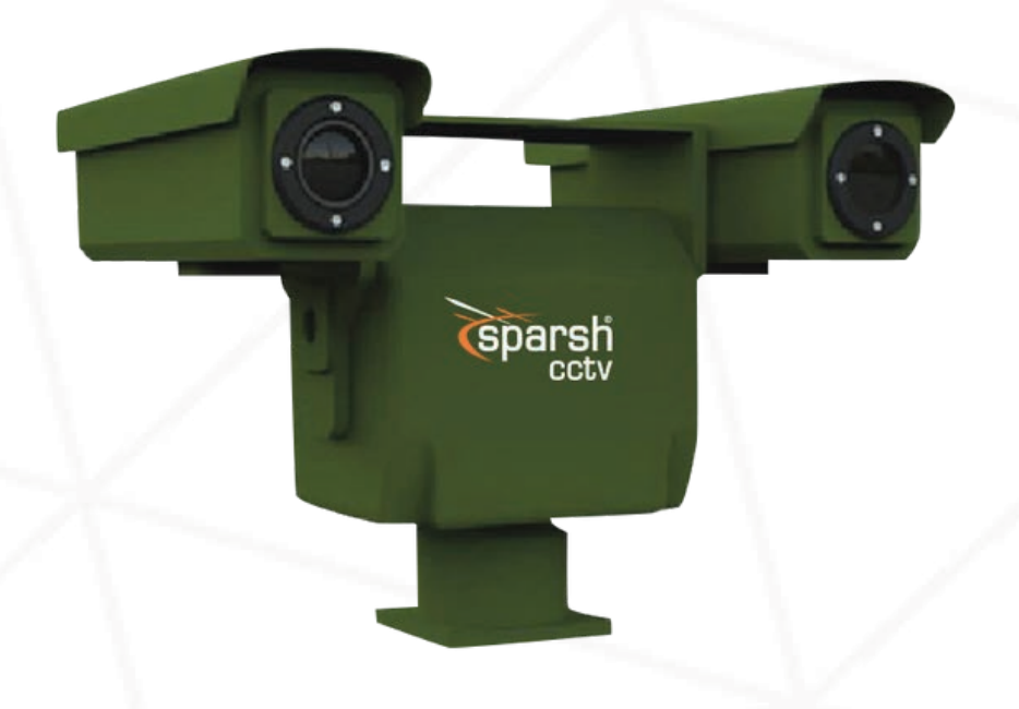
Thermal Camera up to 5Km Range