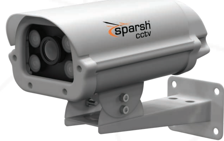
IP Camera with On Edge AI IR Range up to 100 Meter