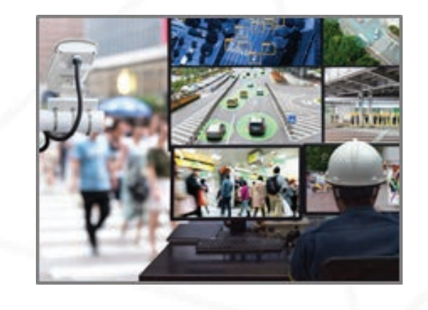
Video Management Software