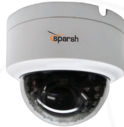
Impact Resistant Camera with Built In - MIC SD Card Storage with ANR Feature