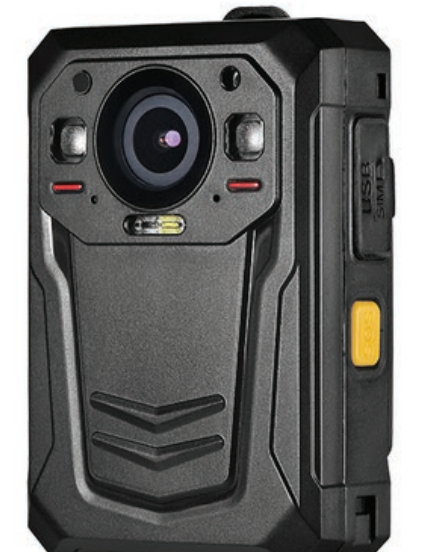
Body Worn Camera with Built-4G SD card Face Recognition