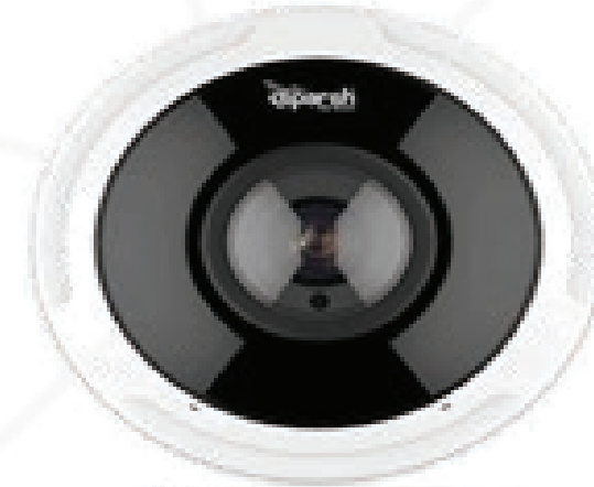
Fisheye Camera 360 Degree Surveillance Resolution upto 4K