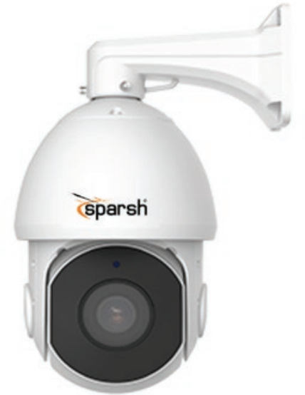
LASER PTZ 42X, 500 Meter Night Vision with Rain Sensing Wiper